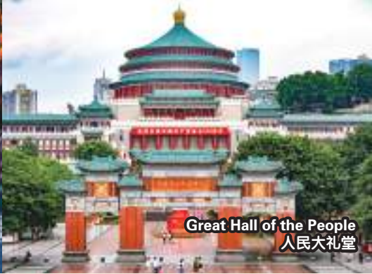
Great Hall of the People 人民大礼堂