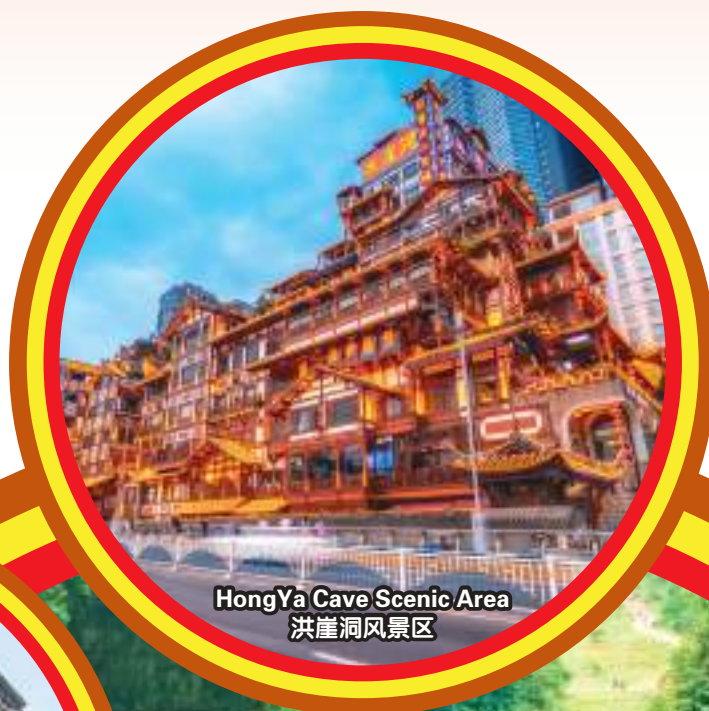
HongYa Cave Scenic Area 洪崖洞风景区