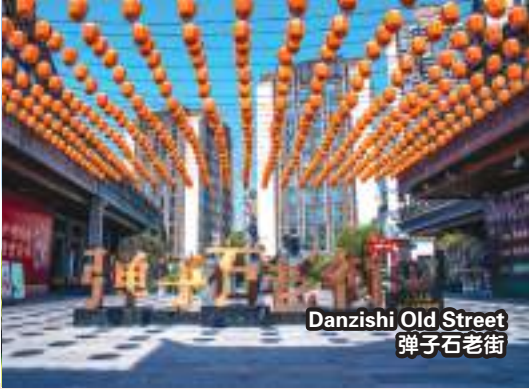
Danzishi Old Street 弹子石老街