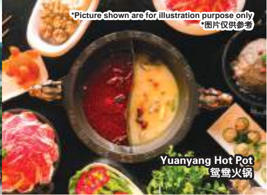
Yuanyang Hot Pot 鸳鸯火锅