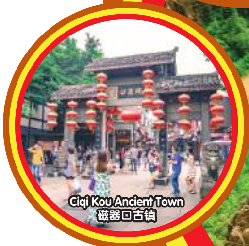
Ciqi Kou Ancient Town 磁器口古镇

行程次序，以当地旅社安排为准。 Sequences of Itinerary are subject to local arrangement.