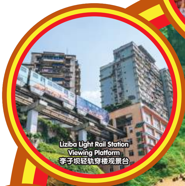
Liziba Light Rail Station Viewing Platform 李子坝轻轨穿楼观景台