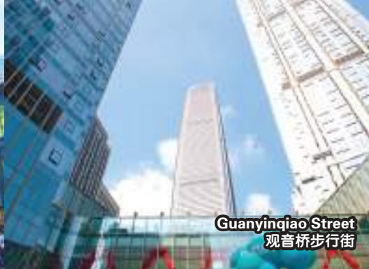
Guanyinqiao Street 观音桥步行街