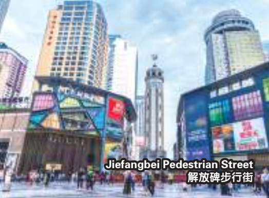
Jiefangbei Pedestrian Street 解放碑步行街