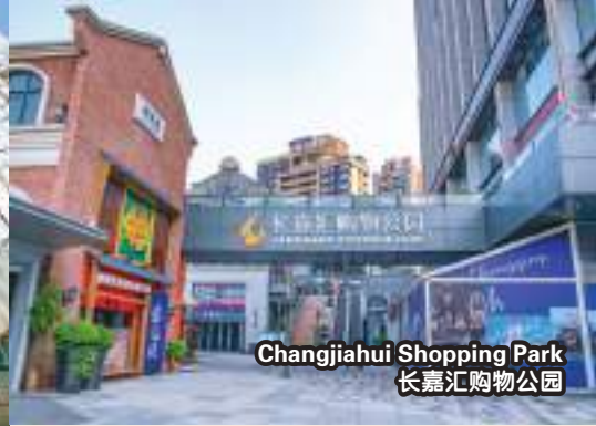
Changjiahui Shopping Park 长嘉汇购物公园