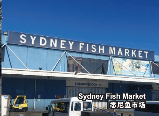
Sydney Fish Market 悉尼鱼市场