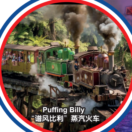
Puffing Billy “谱风比利” 蒸汽火车