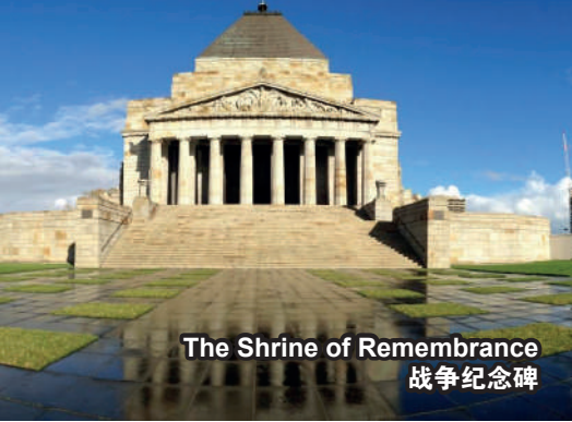
The Shrine of Remembrance 战争纪念碑