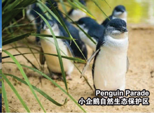
Penguin Parade 小企鹅自然生态保护区