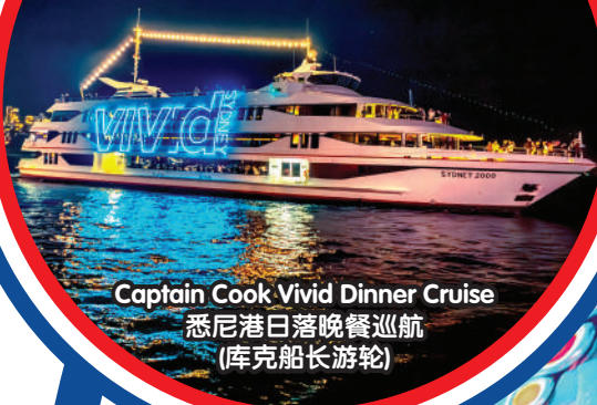
Captain Cook Vivid Dinner Cruise 悉尼港日落晚餐巡航 (库克船长游轮)