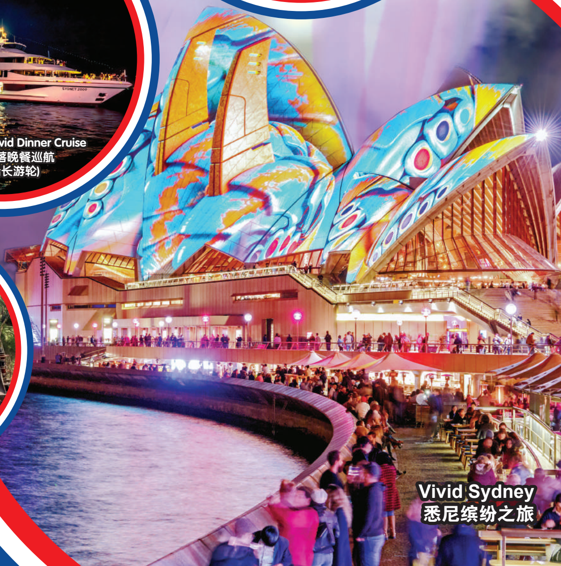
Vivid Sydney 悉尼缤纷之旅

行程次序，以当地旅社安排为准。 Sequences of Itinerary are subject to local arrangement.