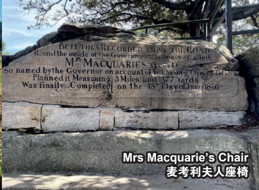
Mrs Macquarie's Chair 麦考利夫人座椅