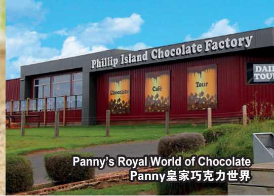
Panny's Royal World of Chocolate Panny皇家巧克力世界