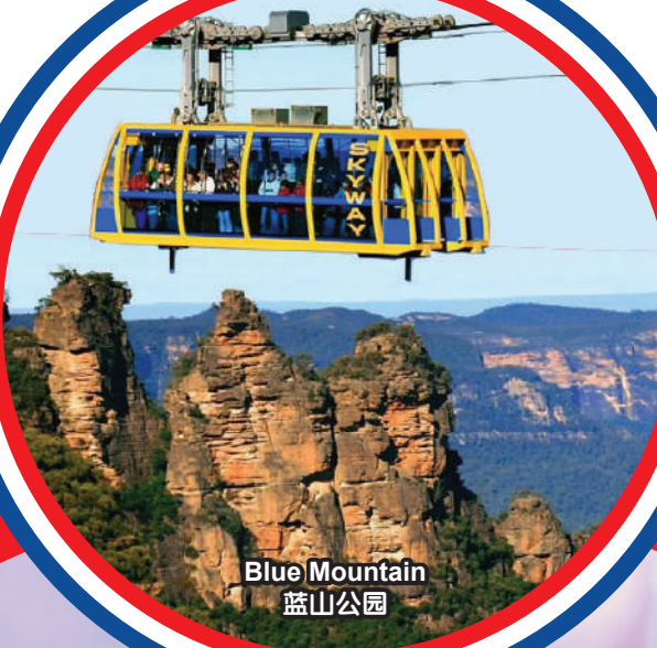
Blue Mountain 蓝山公园