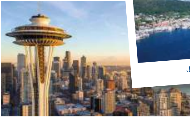
Seattle city view