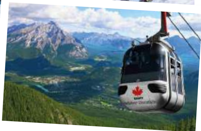
Banff Sulphur Mt. Gondola