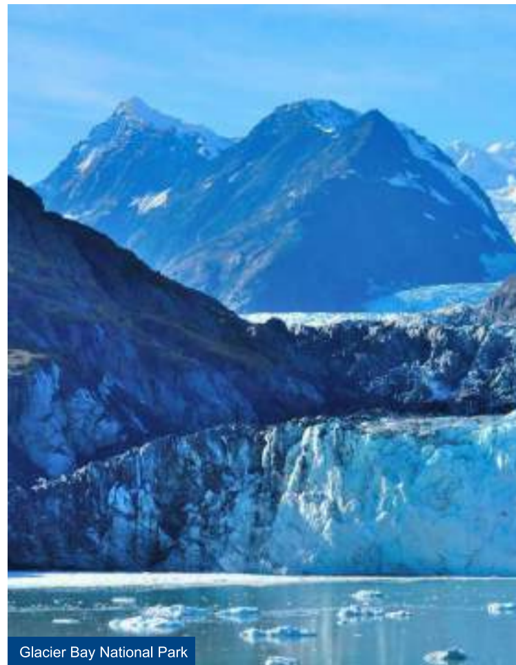
Glacier Bay National Park