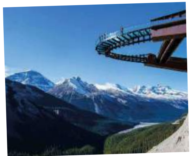
Glacier Bay Skywalk