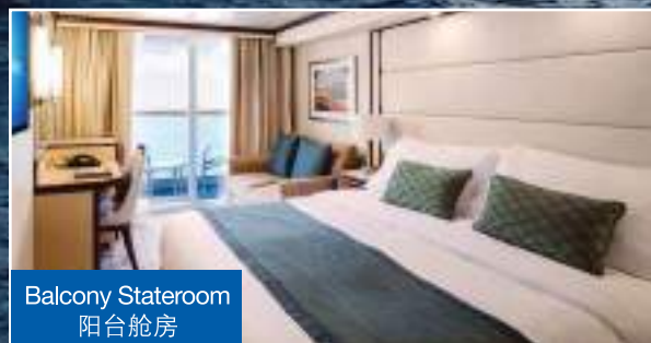
Balcony Stateroom 阳台舱房