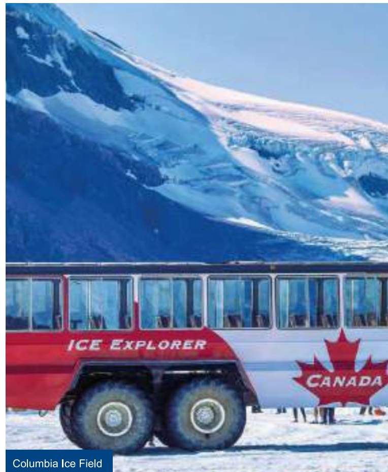
Columbia Ice Field