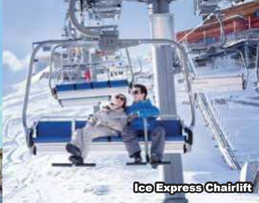
Ice Express Chairlift