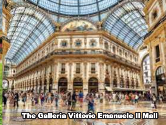
The Galleria Vittorio Emanuele II Mall