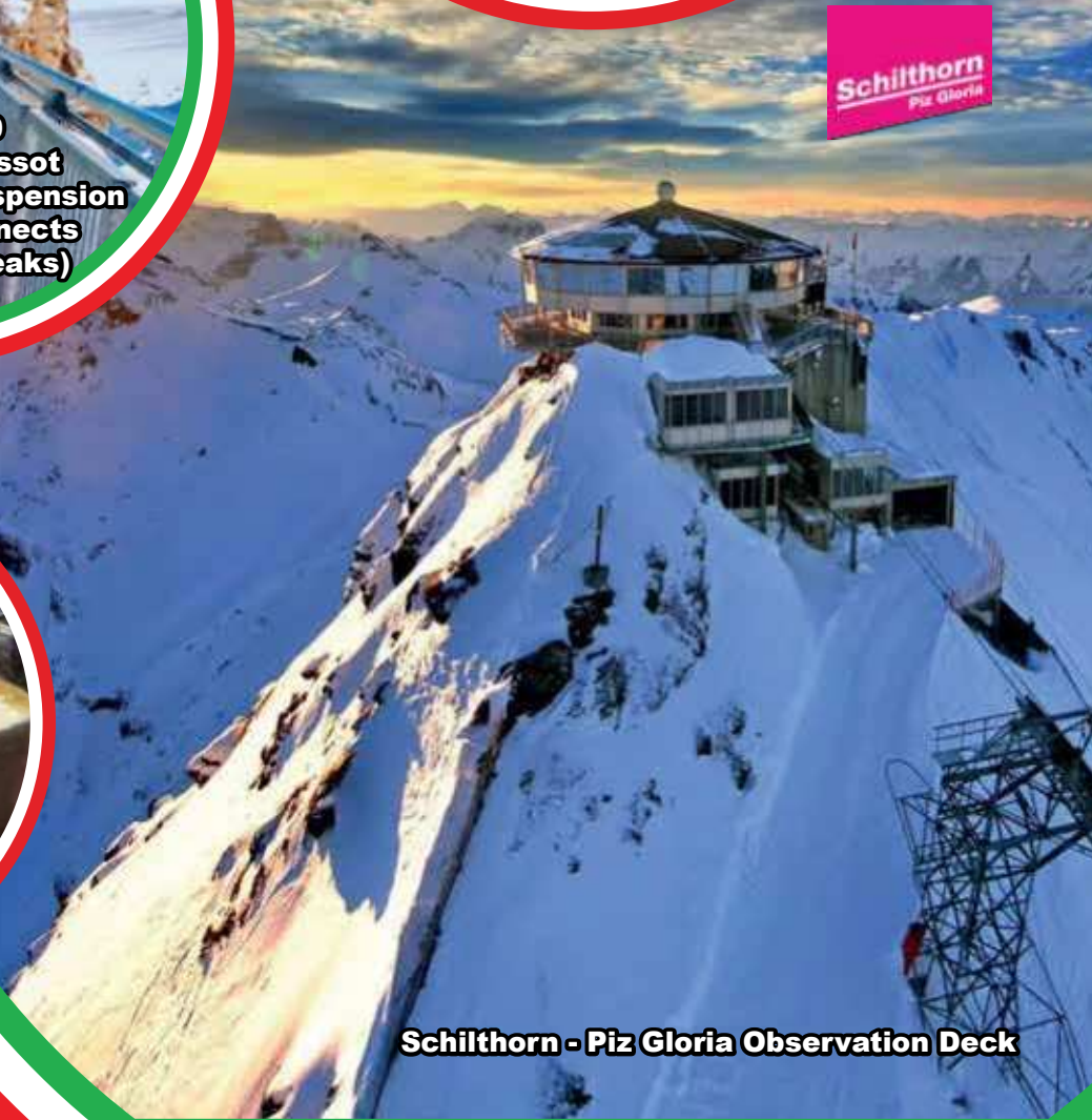
Schilthorn - Piz Gloria Observation Deck