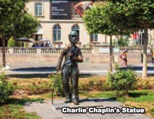
Charlie Chaplin's Statue