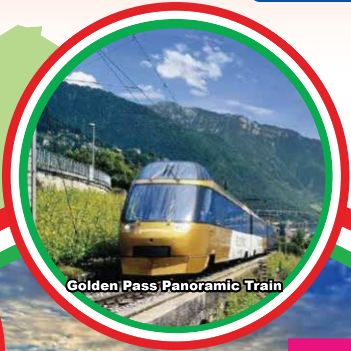
Golden Pass Panoramic Train