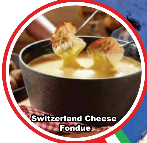
Switzerland Cheese Fondue