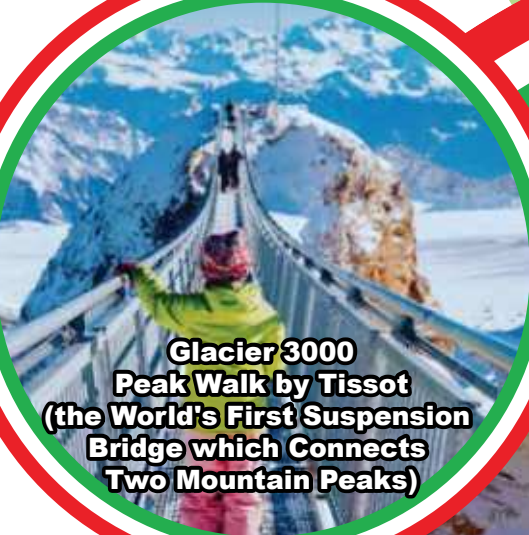
Glacier 3000 Peak Walk by Tissot (the World's First Suspension Bridge which Connects Two Mountain Peaks)